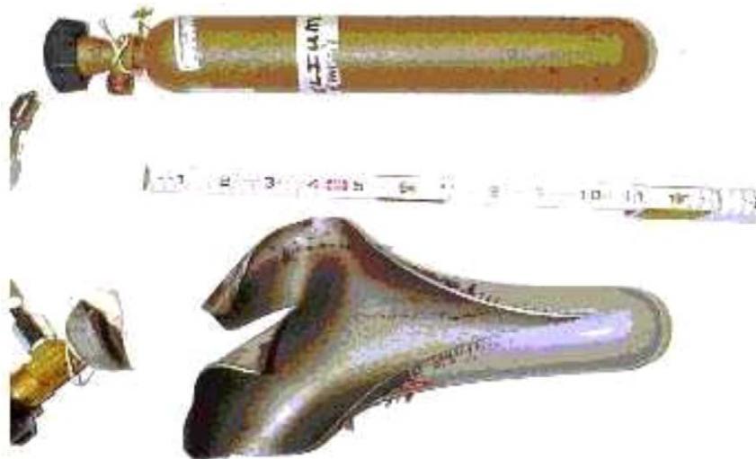
Figure 2. Anhydrous hydrogen fluoride cylinder, before and after catastrophic failure. Note how the failure has resulted in fragmentation of the cylinder.

be found involving anhydrous hydrogen chloride cylinder over pressurizations.