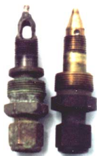
Figure 3. Valve degradation with anhydrous hydrogen bromide. The hole on the left has corroded over time. An original valve is on the right.

A unique problem observed to occur with older gas cylinders containing corrosive gases involves valve degradation or the safety relief device. Many of these cylinders have been found with inoperable valves that will not release gas when the valve wheel is turned to open the valve. Another hazard is that attempts to open the valve can result in the entire valve stem being ejected from the valve body. 19 Prolonged storage of corrosive gases in gas cylinders can corrode pressure relief devices causing them to fail. Failure of the pressure relief device or ejection of the valve stem (Figure 3) will allow